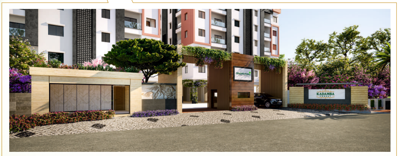
GRAND ENTRANCE PLAZA WITH SCHOOL BAY / WAITING LOBBY